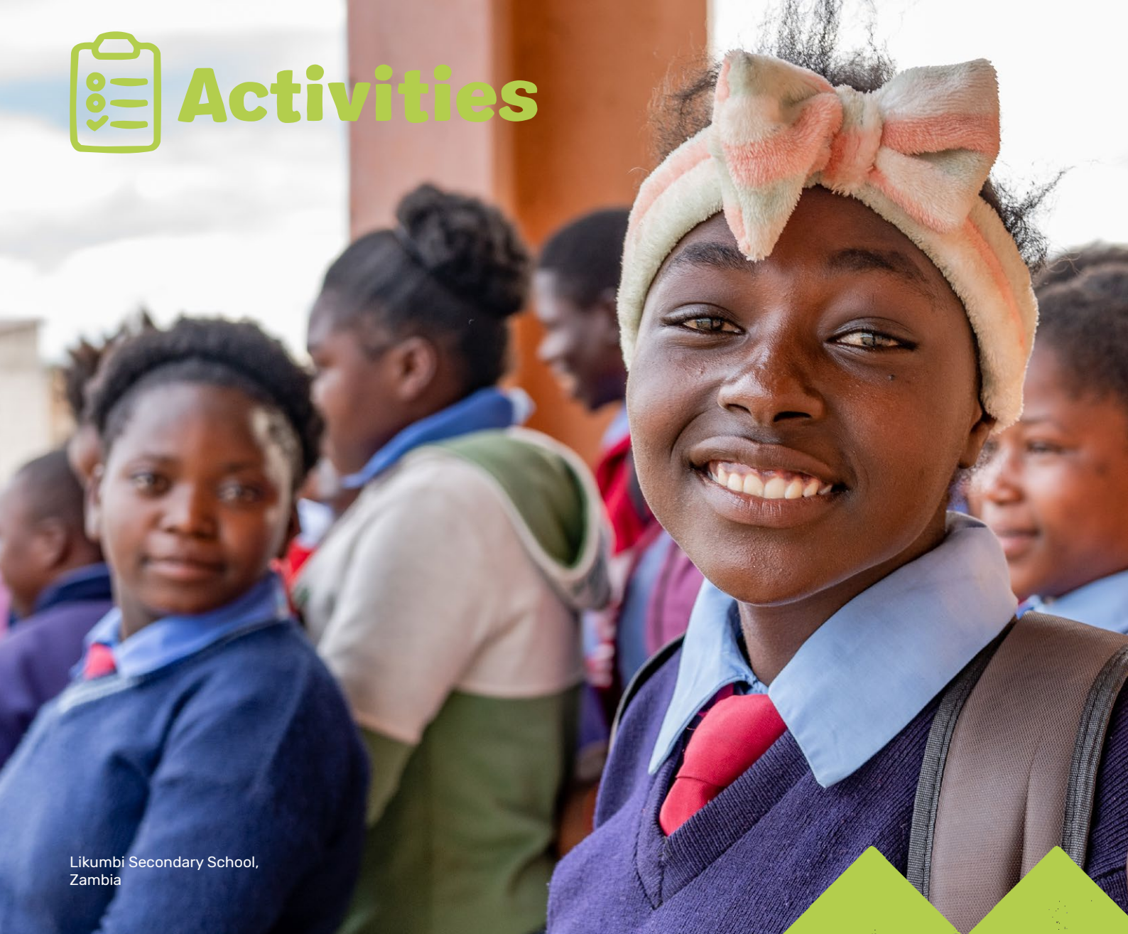
Likumbi Secondary School, Zambia