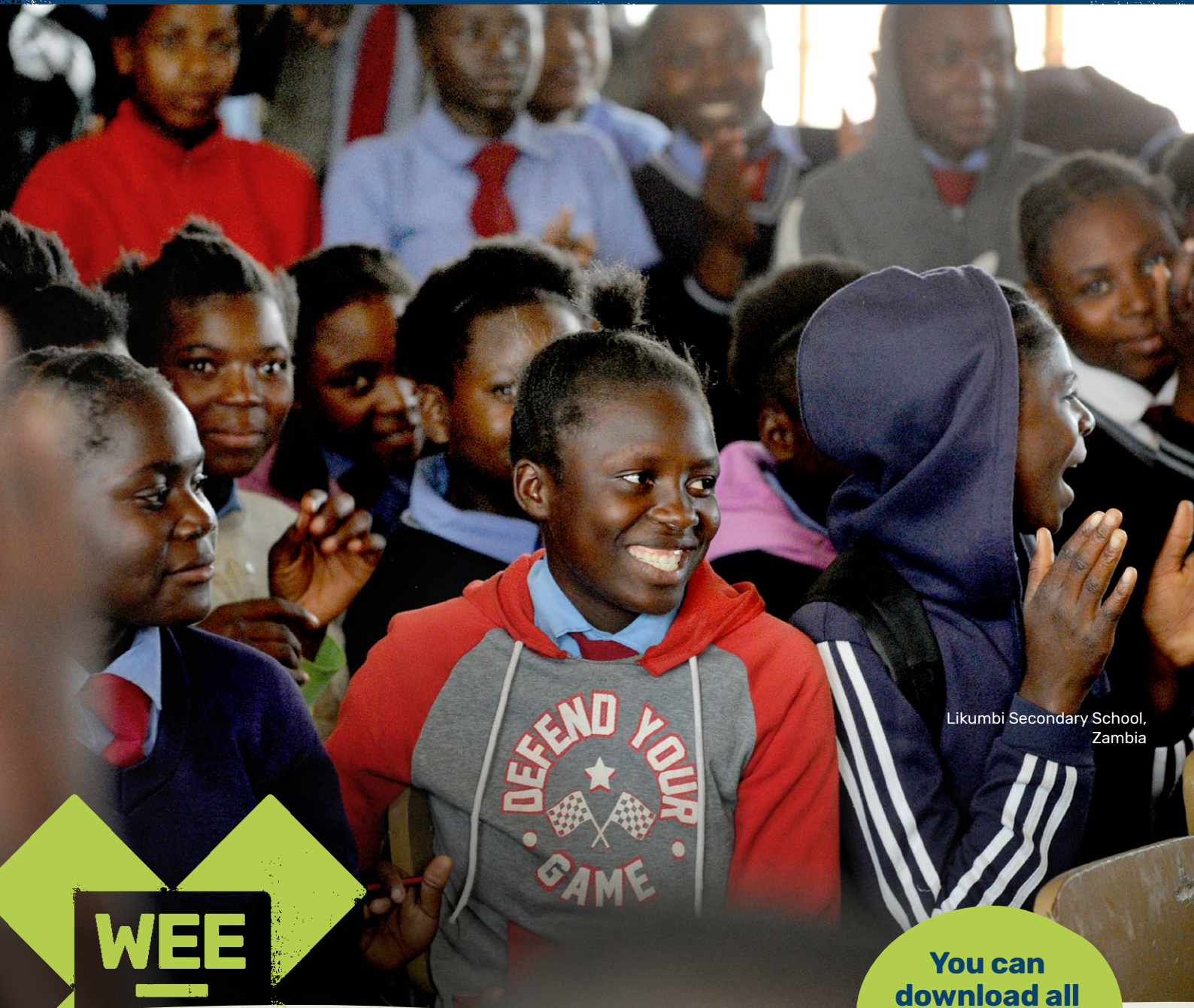
Likumbi Secondary School, Zambia